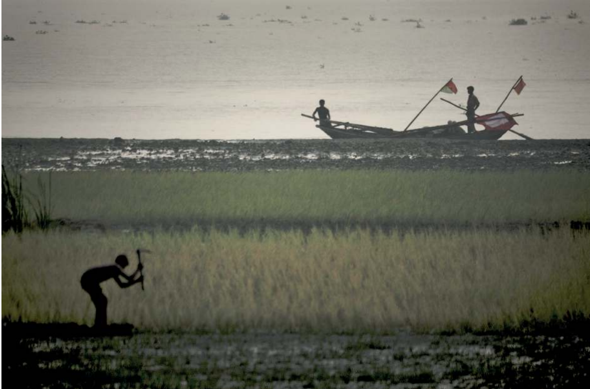
Photograph A for Question 4(a)

Permission to reproduce items where third-party owned material protected by copyright is included has been sought and cleared where possible. Every reasonable effort has been made by the publisher (UCLES) to trace copyright holders, but if any items requiring clearance have unwittingly been included, the publisher will be pleased to make amends at the earliest possible opportunity.